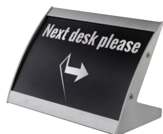
New Curved Design