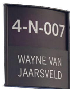
Classic Curved Design