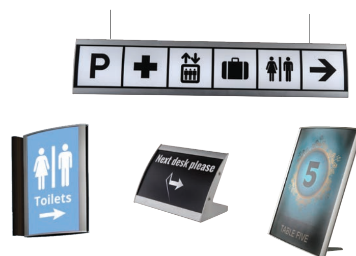
New Modular Way-Finding System