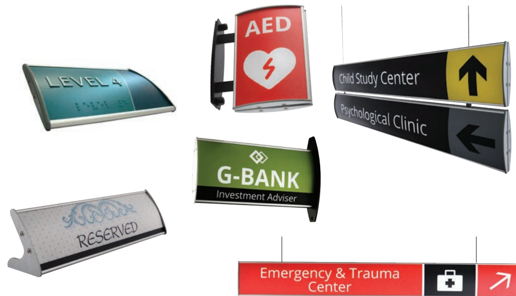
Classic Modular Way-Finding System